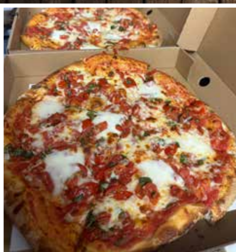
Mouthwatering pizza at Manucci's Italian in Cardigan