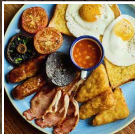
Now that's a breakfast at The Athro Lounge in Aberystwyth