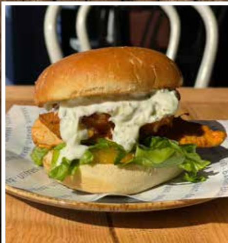
Tandoori Chicken Burger at Baravin in aberystwyth