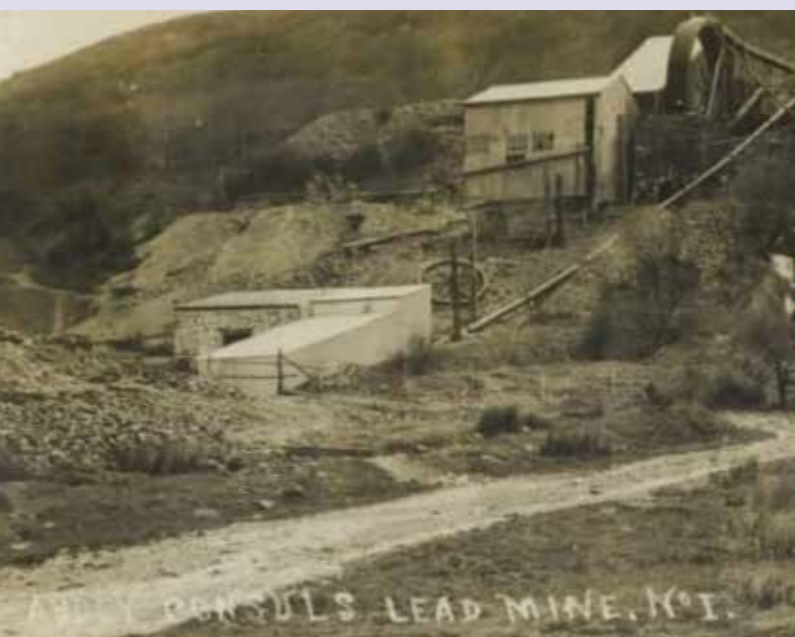
silver, and zinc.

One site earmarked for remedial work is Abbey Consols, located northeast of Strata Florida near Pontrhydfendigaid. Historically significant, this site may have been mined by Cistercian monks during the Middle Ages and was extensively worked in the 19th century for lead, silver, and zinc.