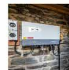
Solar PV Battery Storage