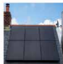
Residential Solar PV Panels