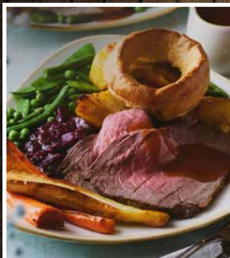
Classic Sunday Roast at The Ship Inn, Tresaith