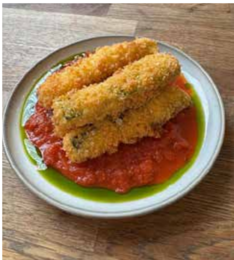
Parmesan crusted courgette fries at Medina in Aberystwyth