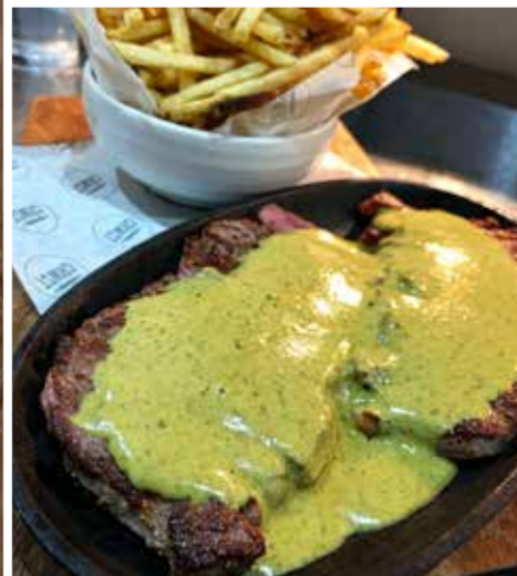
Steak Night at Crwst in Cardigan