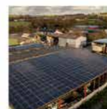
Commercial PV Solar Panels