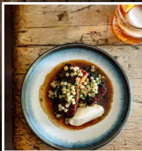
A wonderful looking piece of beef at Yr Hen Printworks in Cardigan!