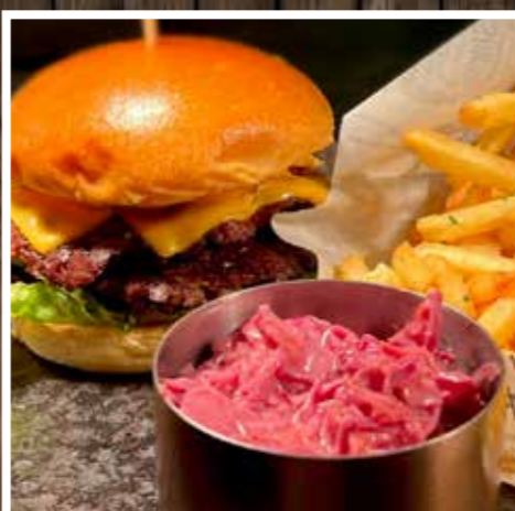
The Copper Pot Smash Burger in Cardigan!

Make sure you detail where it is from, and the name of the dish!