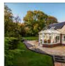
Renewable Energy Solutions